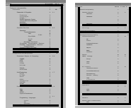
Figure 2: Frequency and accumulated frequency of the key words for "Interoperability in GIS"

As could be expected most of the materials were found in the field "Technical Interoperability". The overriding progress was obviously made in informatics both in theory and practice. The subjects "Semantic Interoperability" and "Other aspects of Interoperability" are still under-represented.